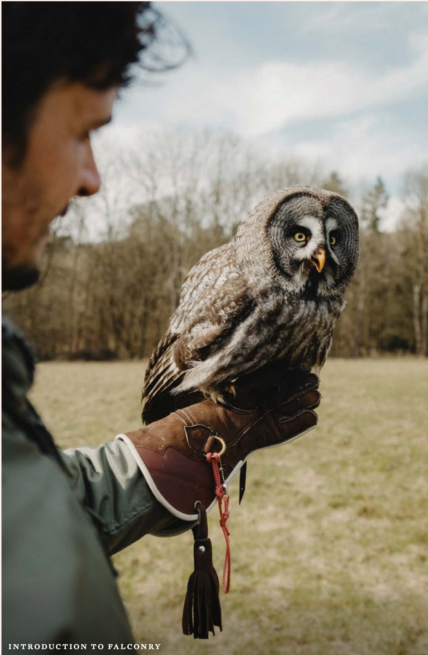
INTRODUCTION TO FALCONRY