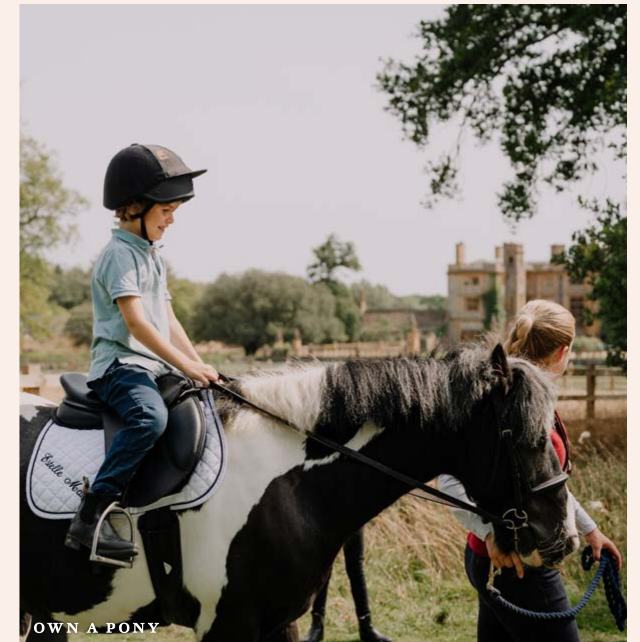
OWN A PONY