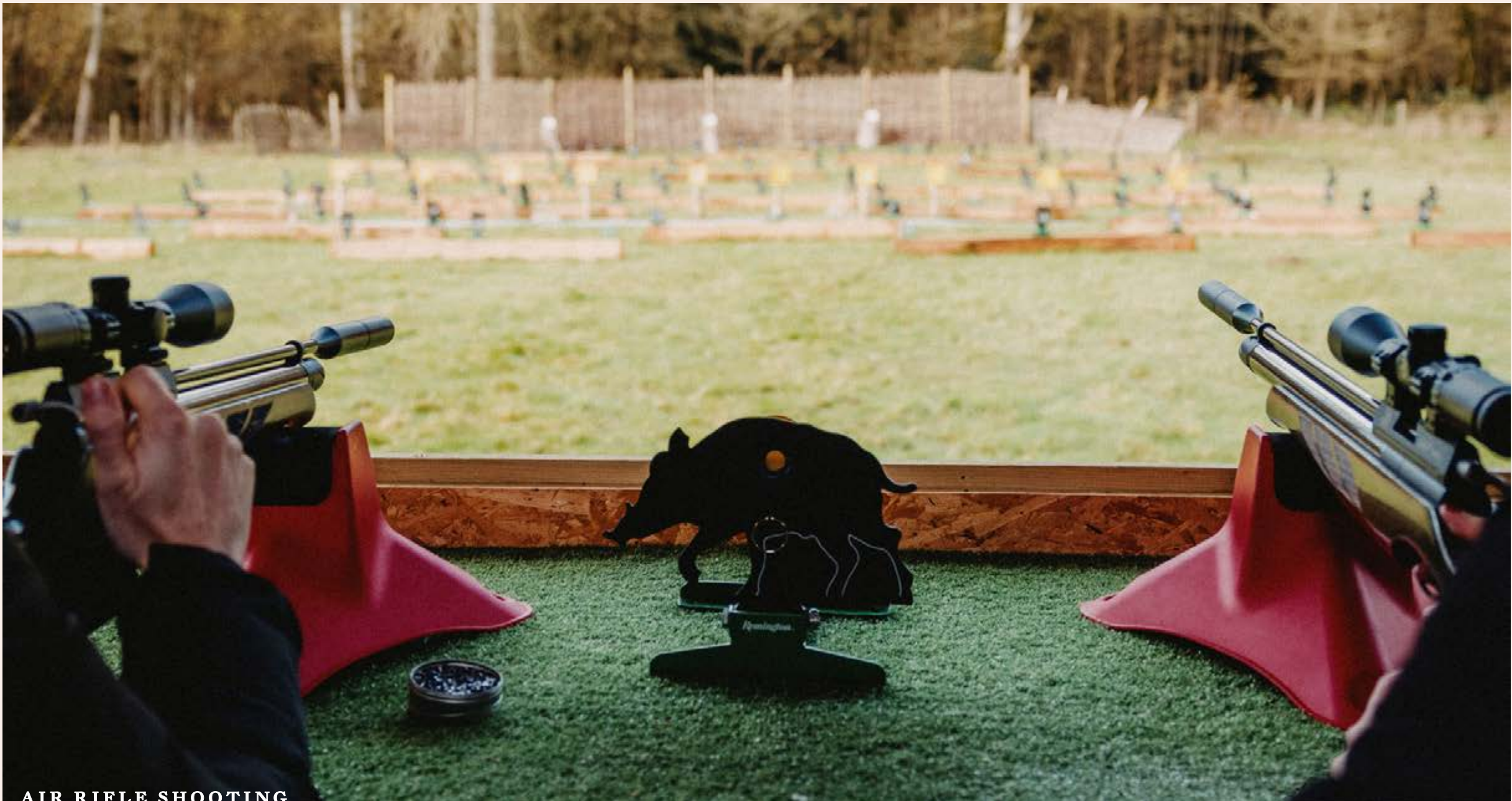
AIR RIFLE SHOOTING