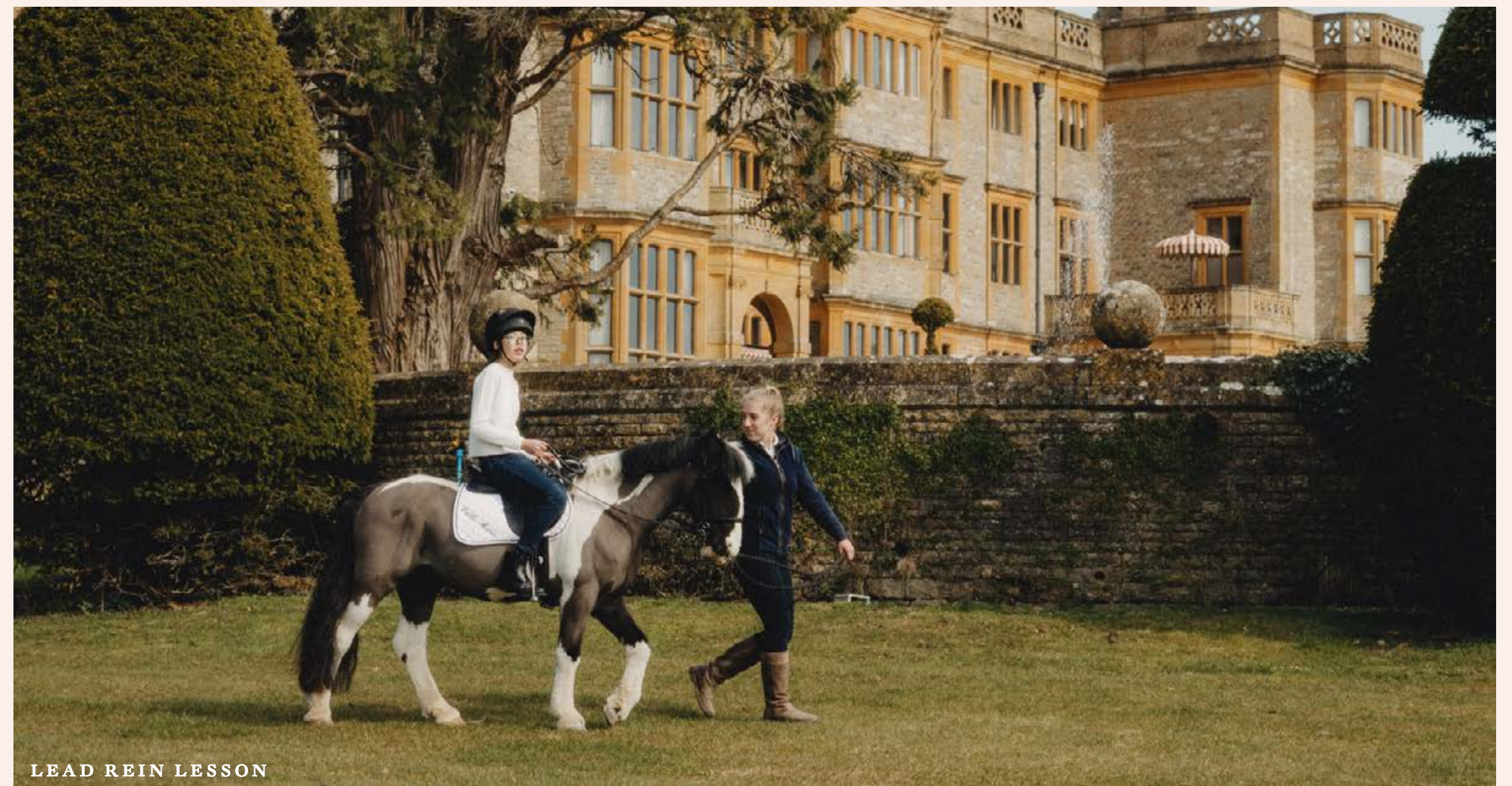
LEAD REIN LESSON