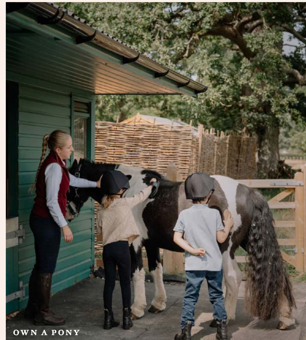
OWN A PONY